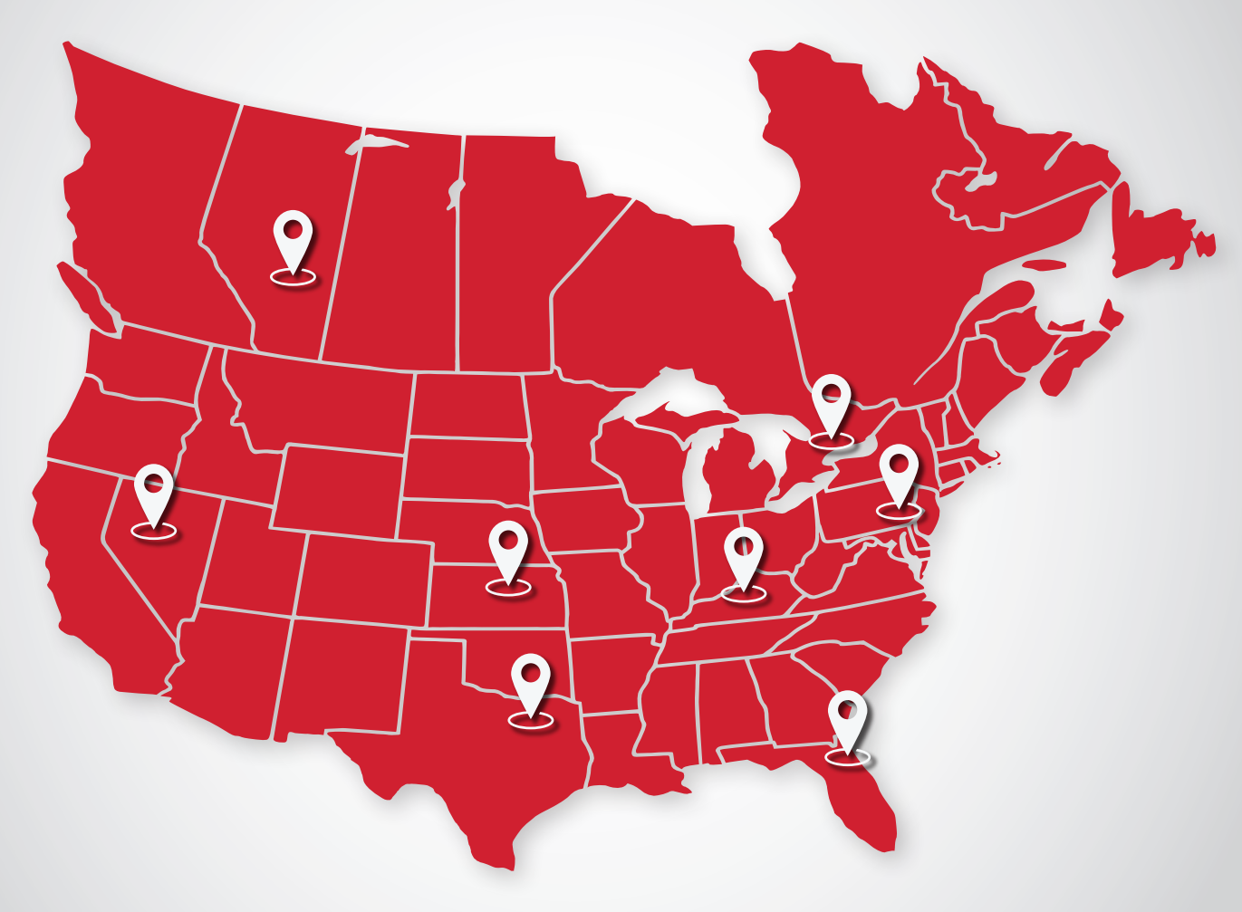
*Not currently available for sale or use in California.

Roadwarrior Inc. has stock in multiple warehouses strategically located across North America to ensure your order reaches you as quickly as possible.